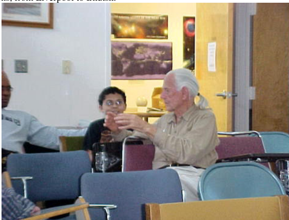
Dobson at HCAS Observatory.

By 1968, he had made dozens of telescopes and had taught others to do so as well. The monks, however, had become angered with the time he had spent doing this "hobby" and expelled him from the monastery. Initially distraught over the monks' decision, Dobson founded his own organization, the Sidewalk Astronomers , which has become nationwide. For almost 40 years, he has travelled the world with his telescopes, from state parks to Indian reservations, from Liverpool to Irkutsk.